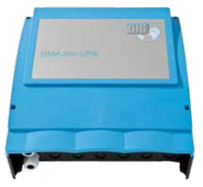
Redundant power supply in IP-65 wall-mounted housing: GMA 200-UPS