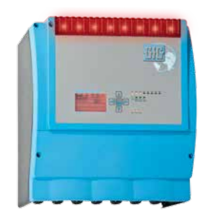
GMA 200-MW in IP-65 wall-mounted housing